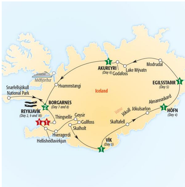
MAP OF TOUR

DURATION: 10 days (counts 1 st and 10 th day)