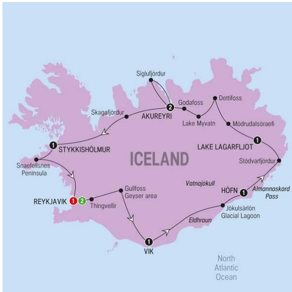
MAP OF TOUR