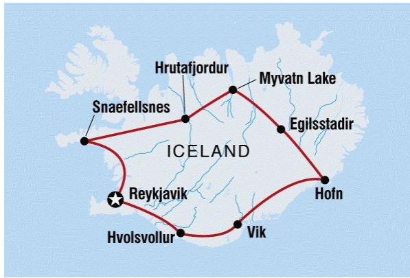
MAP OF TOUR