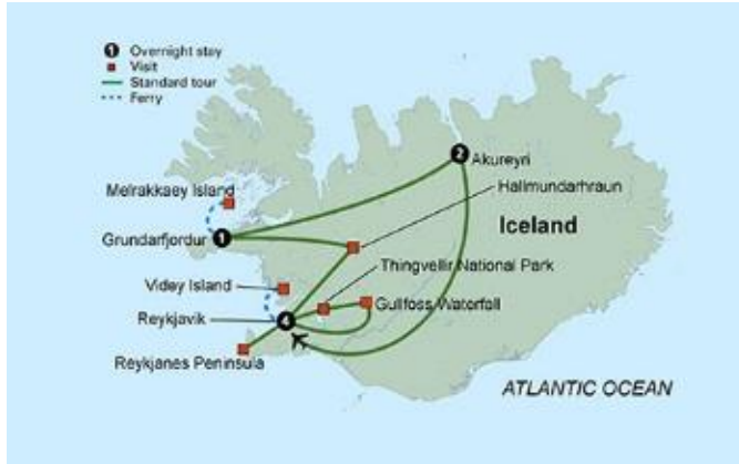
MAP OF TOUR:

DURATION: 10 days (They count the 1 st arrival and the 10 th departure)